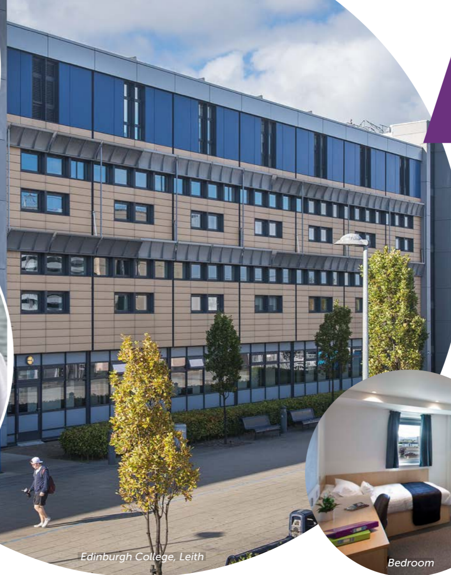
Edinburgh College, Leith