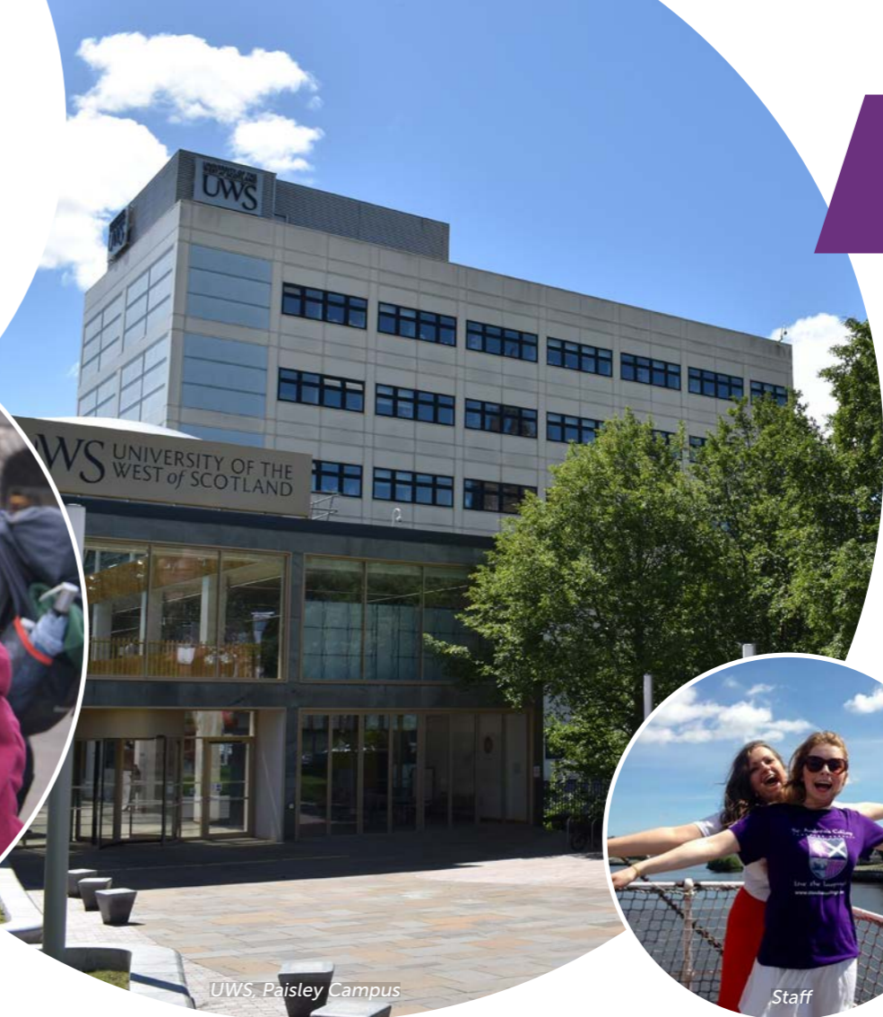
UWS, Paisley Campus