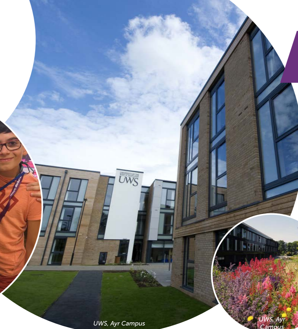
UWS, Ayr Campus