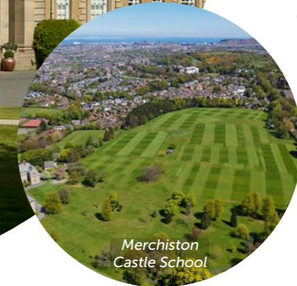
Merchiston Castle School

We had a great time and came back full of wonderful memories. The staff has been professional and at same time friendly. And so the teachers. And perfect was the food and staff at the canteen. Thanks again for making all of this possible.