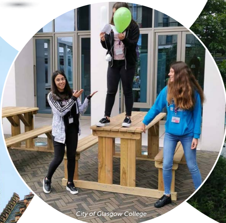
City of Glasgow College