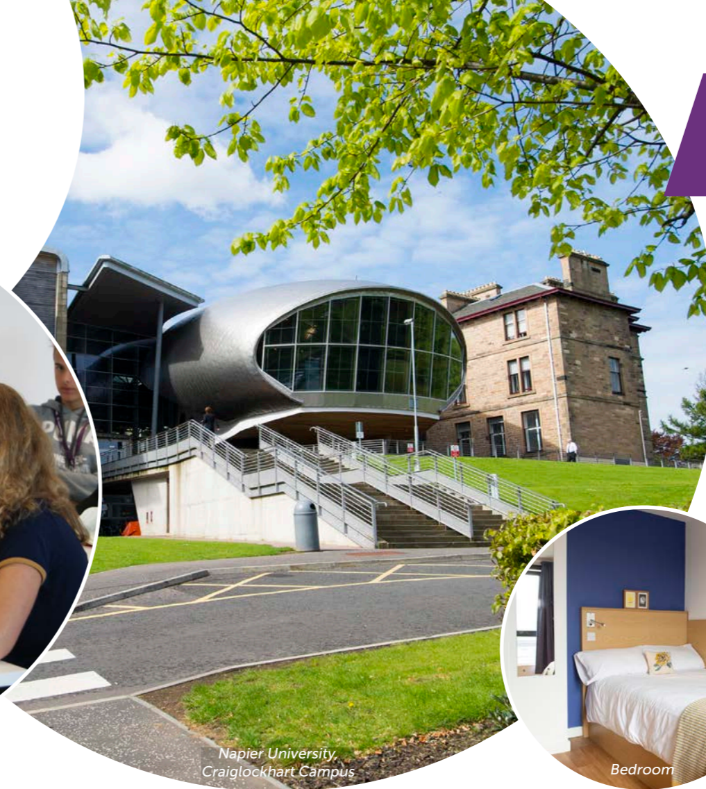
Napier University, Craiglockhart Campus