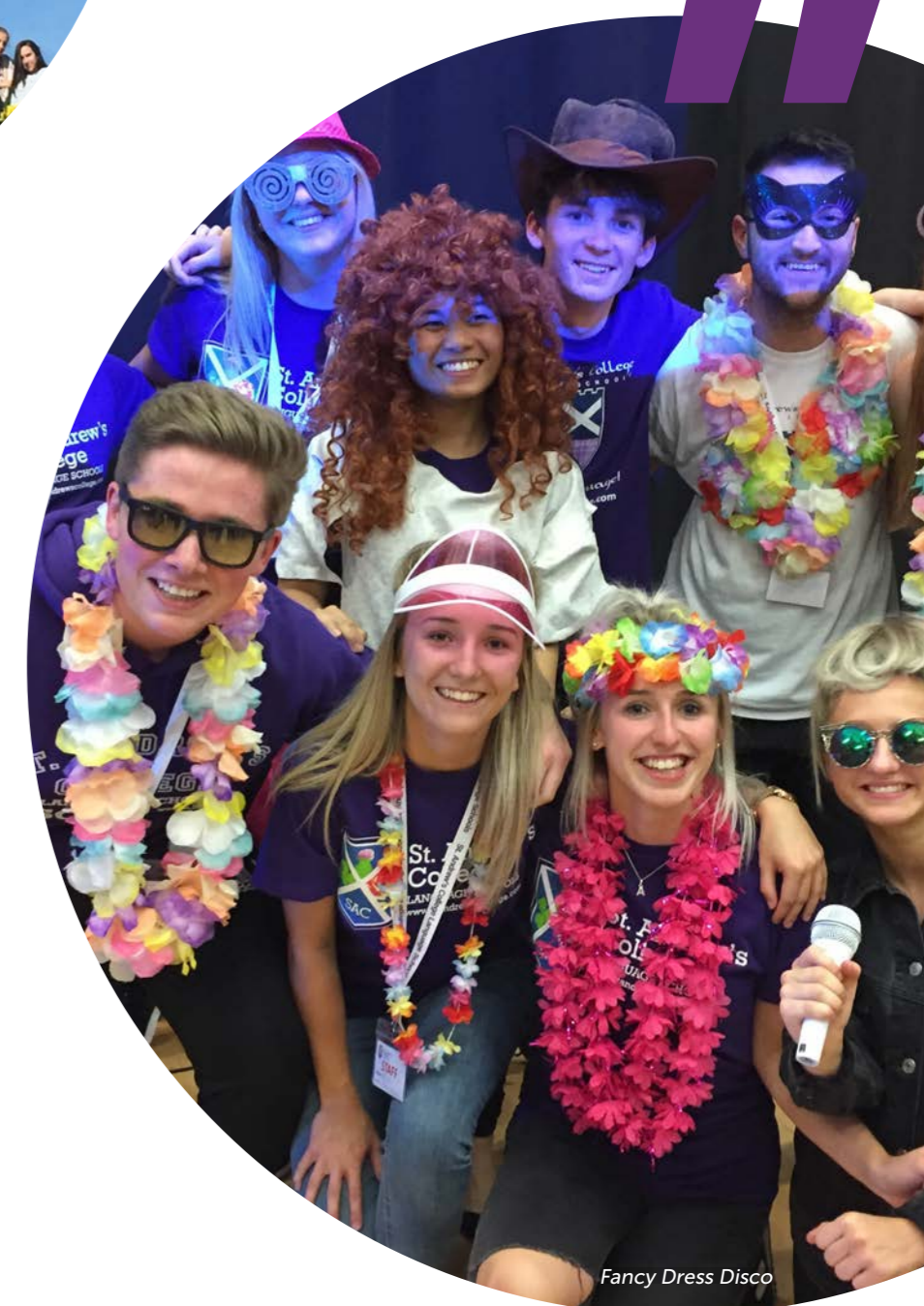
Fancy Dress Disco