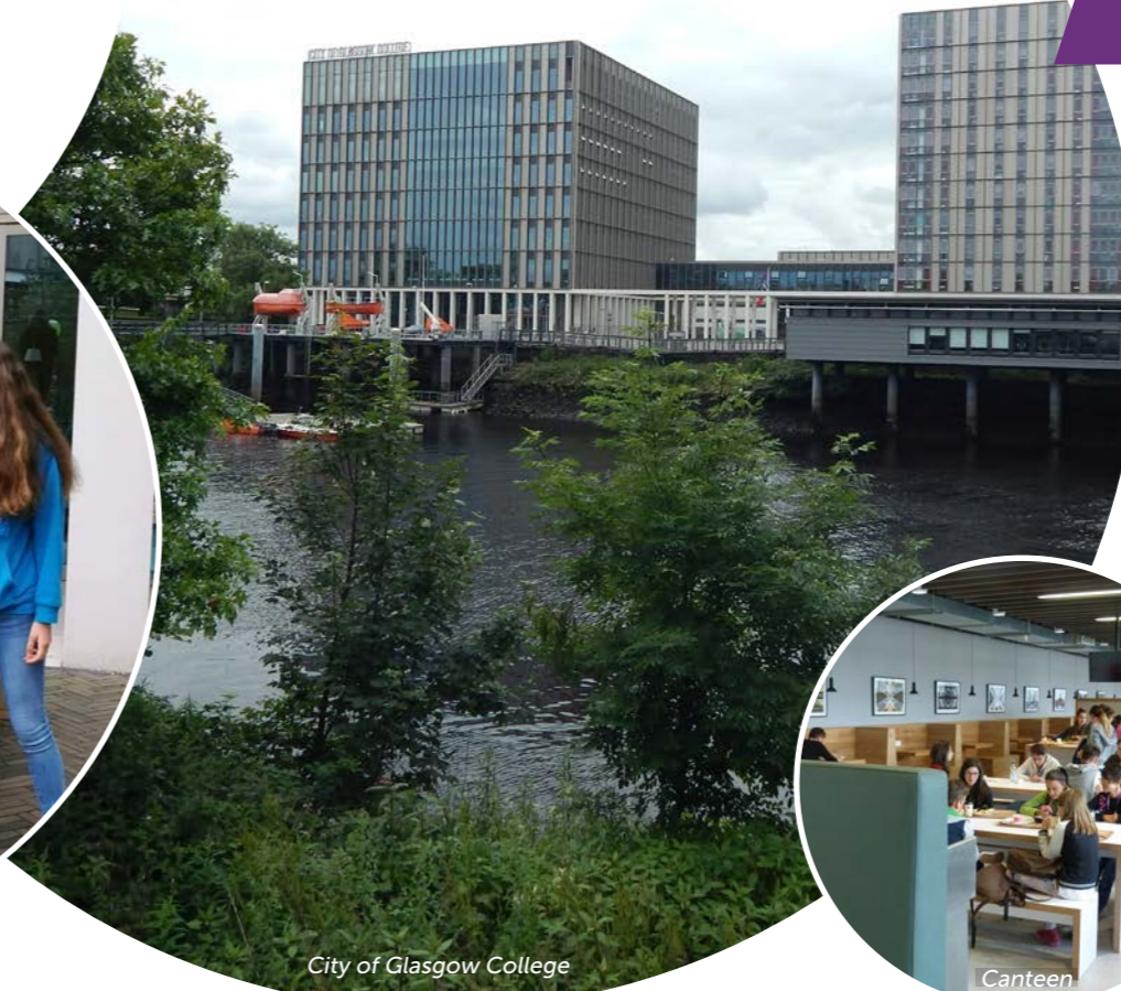
City of Glasgow College