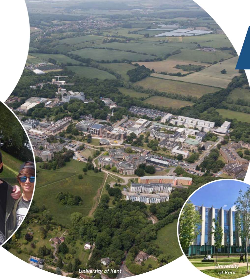
University of Kent