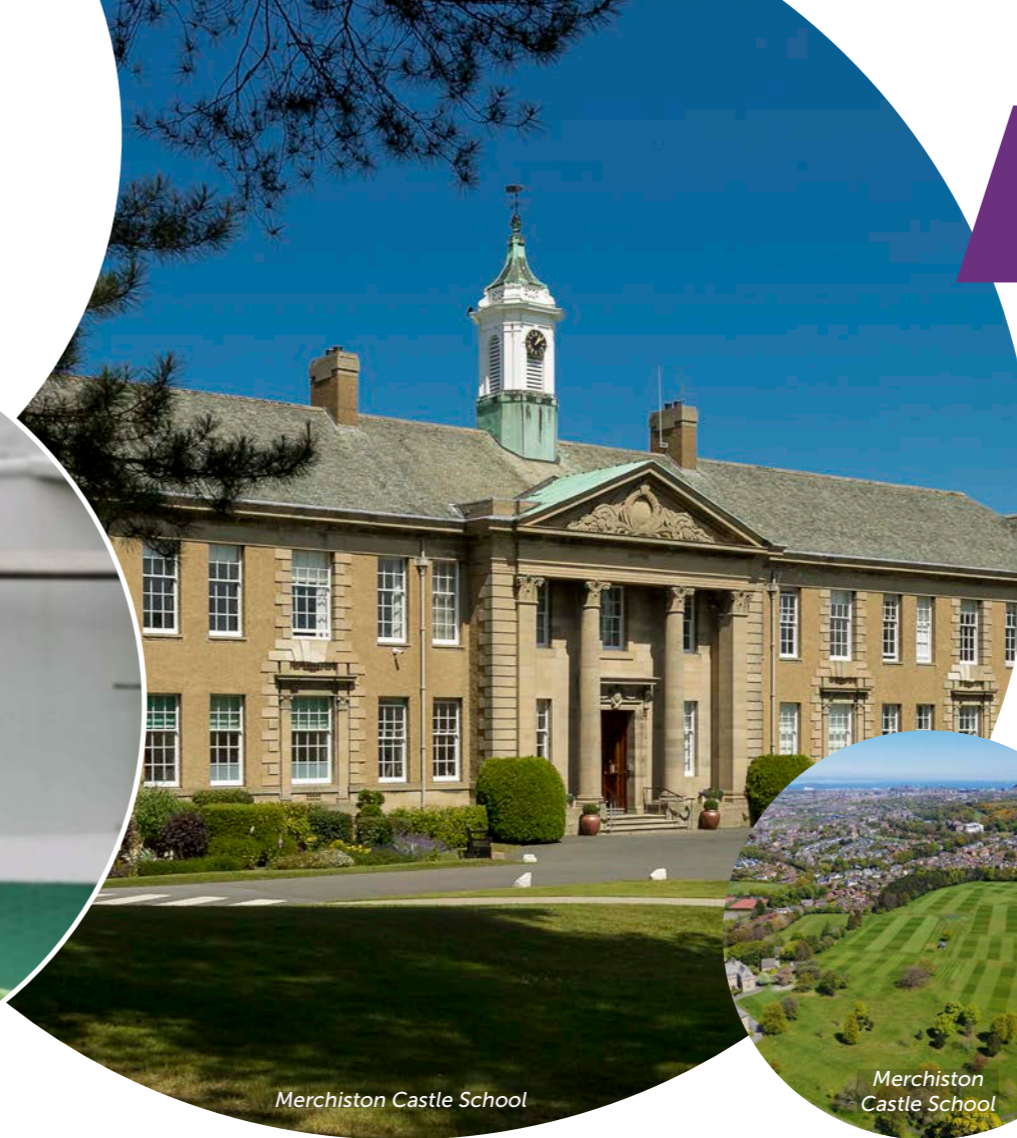
Merchiston Castle School