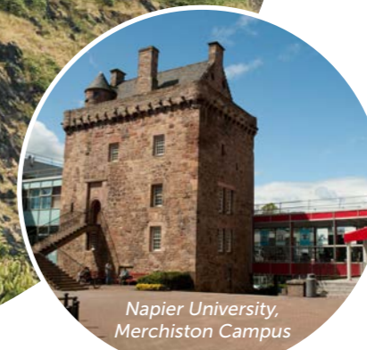
Napier University, Merchiston Campus

My classes were very good, I enjoyed meeting people from different cultures and speaking in English. The teachers were very nice they helped me to speak English much better than I could before.