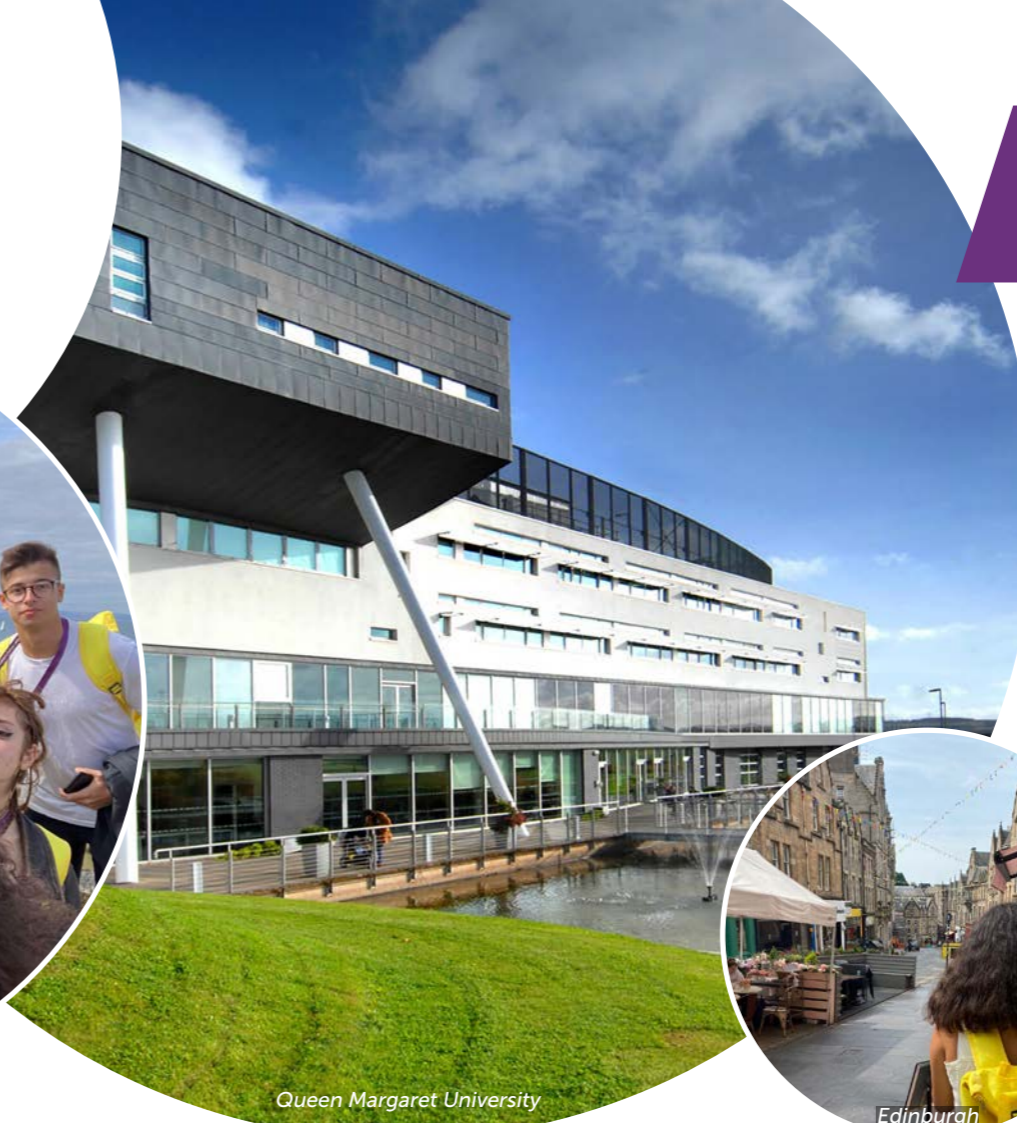
Queen Margaret University