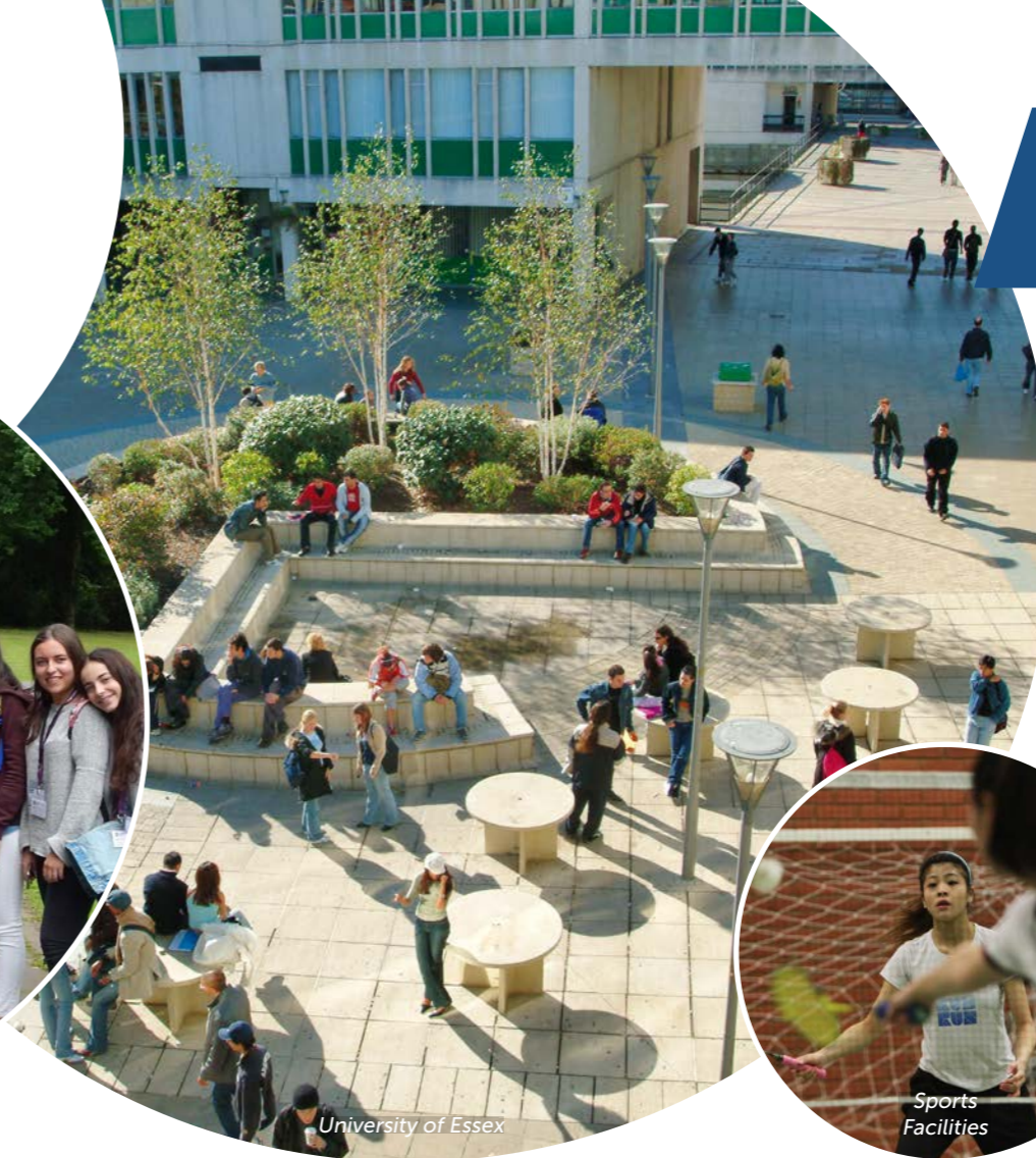
University of Essex