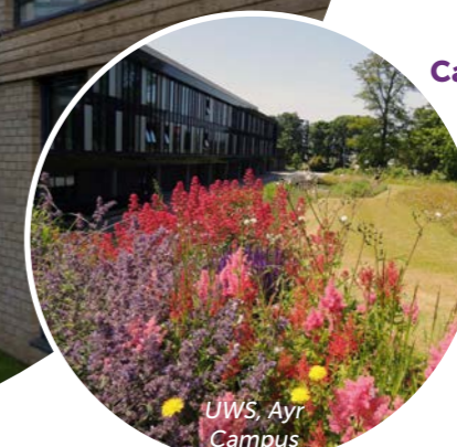
UWS, Ayr Campus

Before coming to this school I thought the classes would be very boring... I was so wrong!! They were so interesting and great fun, teachers were so friendly and kind. Sports, all activities and excursions were just great.