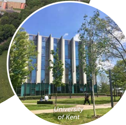
University of Kent

It's a very good college, a beautiful area, and the staff were very nice.