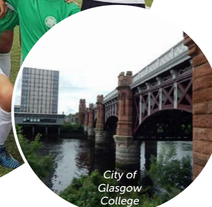
City of Glasgow College

Here we are once more back to St Andrew's. They fulfil everyone's expectations, students, parents and group leaders. Our recommendation: try it and you will be involved in an unforgettable lifetime experience.