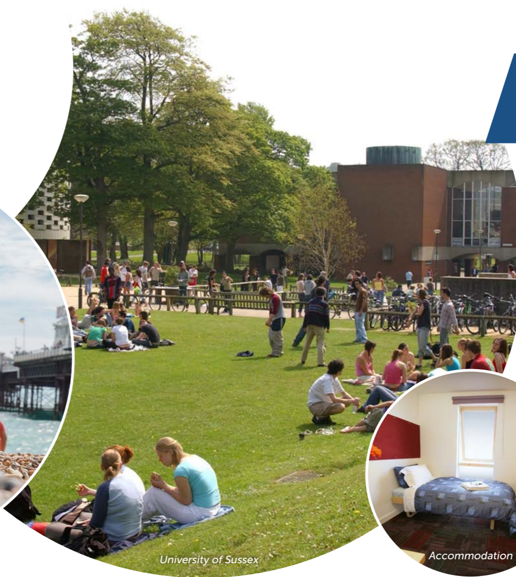
University of Sussex